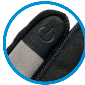
PIAGGIO TOUCH GLOVES