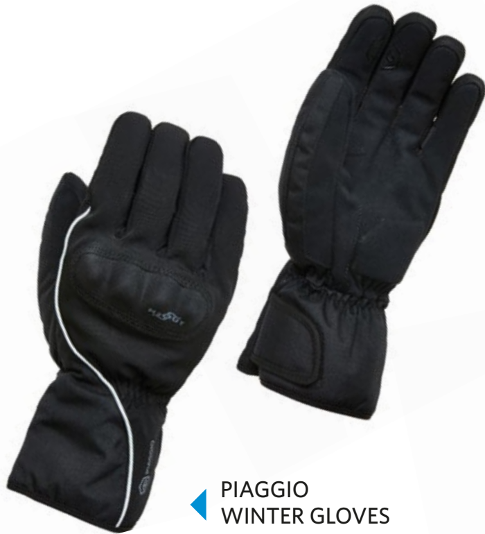
PIAGGIO WINTER GLOVES