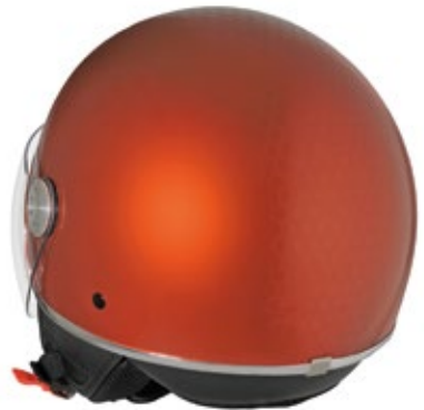
PIAGGIO MIRROR BT HELMET